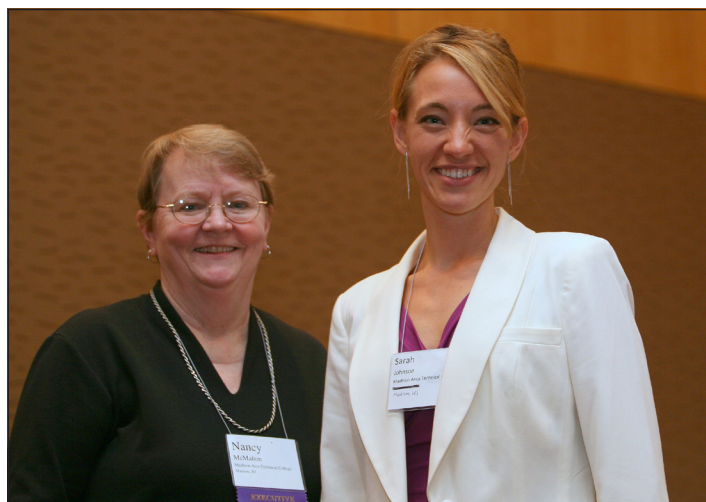
MATC employees say, “Come join us in October!”