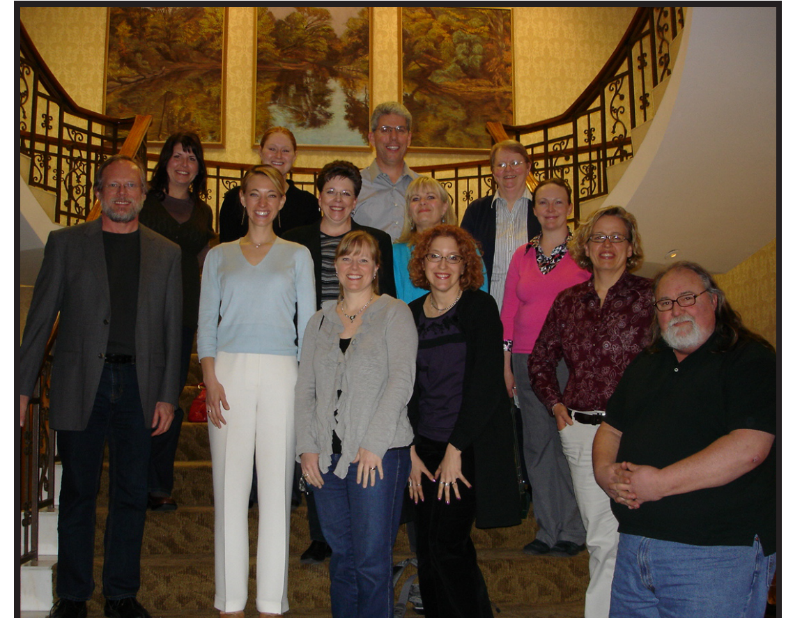
Board Members at Spring Planning Meeting in Madison, Wisconsin April 2009